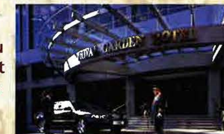
Royal Garden Hotel

British Airways will fly you and a guest round-trip from New York to London, where you'll begin your trip with a luxurious three-night weekend stay in an Executive Apartment at the five-star Athenaeum Hotel & Apartments, followed by three nights at the five-star Royal Garden Hotel. While in London, you will attend a performance at the Royal Opera (subject to schedule and availability).