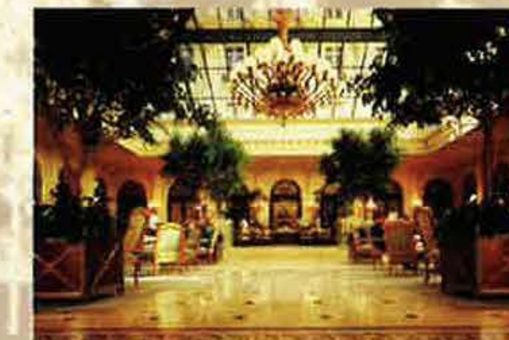
Le Grand Hotel Inter-Continental

You then will travel from the heart of London to the heart of Paris, where you'll spend four nights at Le Grand Hotel Inter-Continental, located just opposite the Palais Garnier opera house and near many of the city's cultural attractions. While in Paris, you will attend another memorable opera performance (subject to schedule and availability). Generously donated by the Athenaeum Hotel, Royal Garden Hotel, Le Grand Hotel Inter-Continental and British Airways.